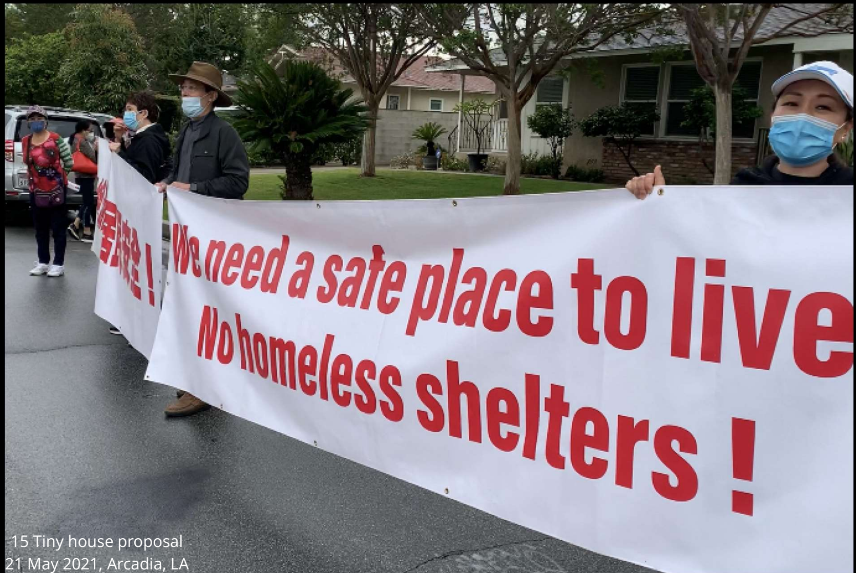
15 Tiny house proposal 21 May 2021, Arcadia, LA